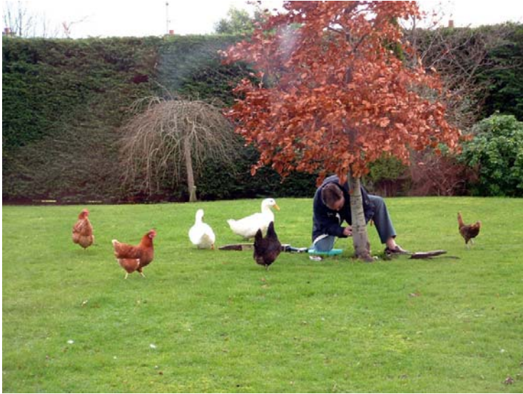
This is Winnie and Pooh with Their little helpers Lulu, Cilla, Dippy, Rosie, helping with the Christmas lights! Easy knowing they live in a veggie household!